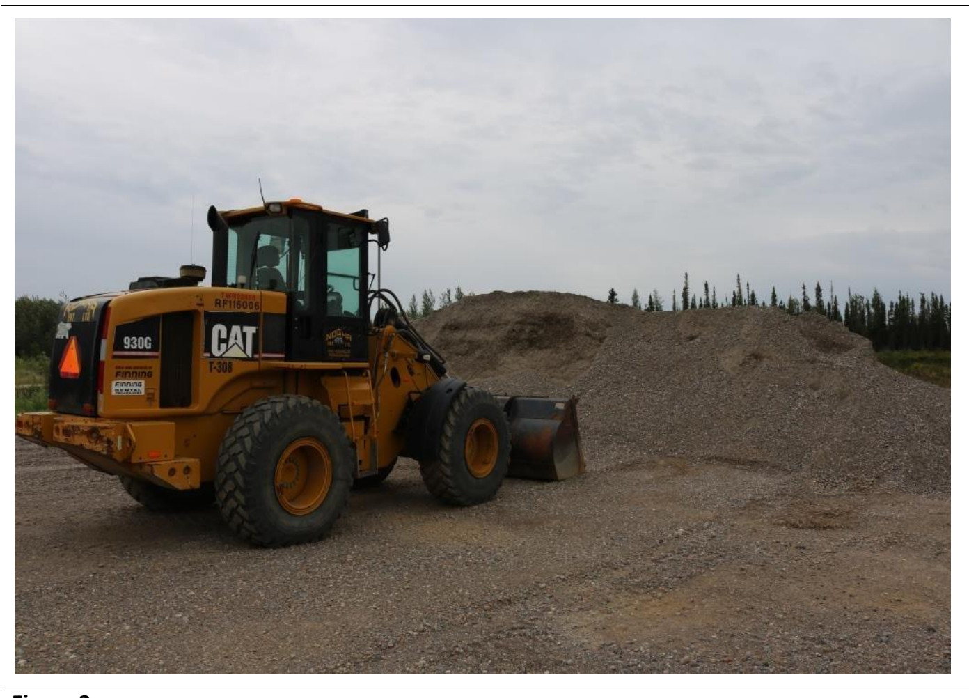
Figure 2 No Drip Tray beneath Loader