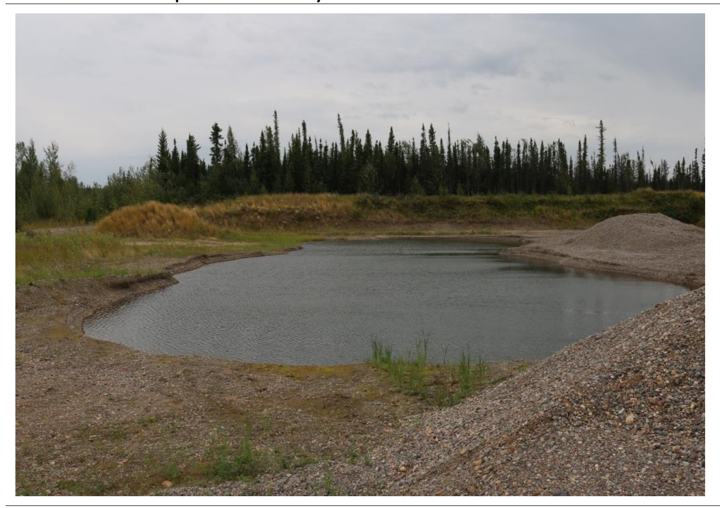
Figure 6 Vegetation Regrowth