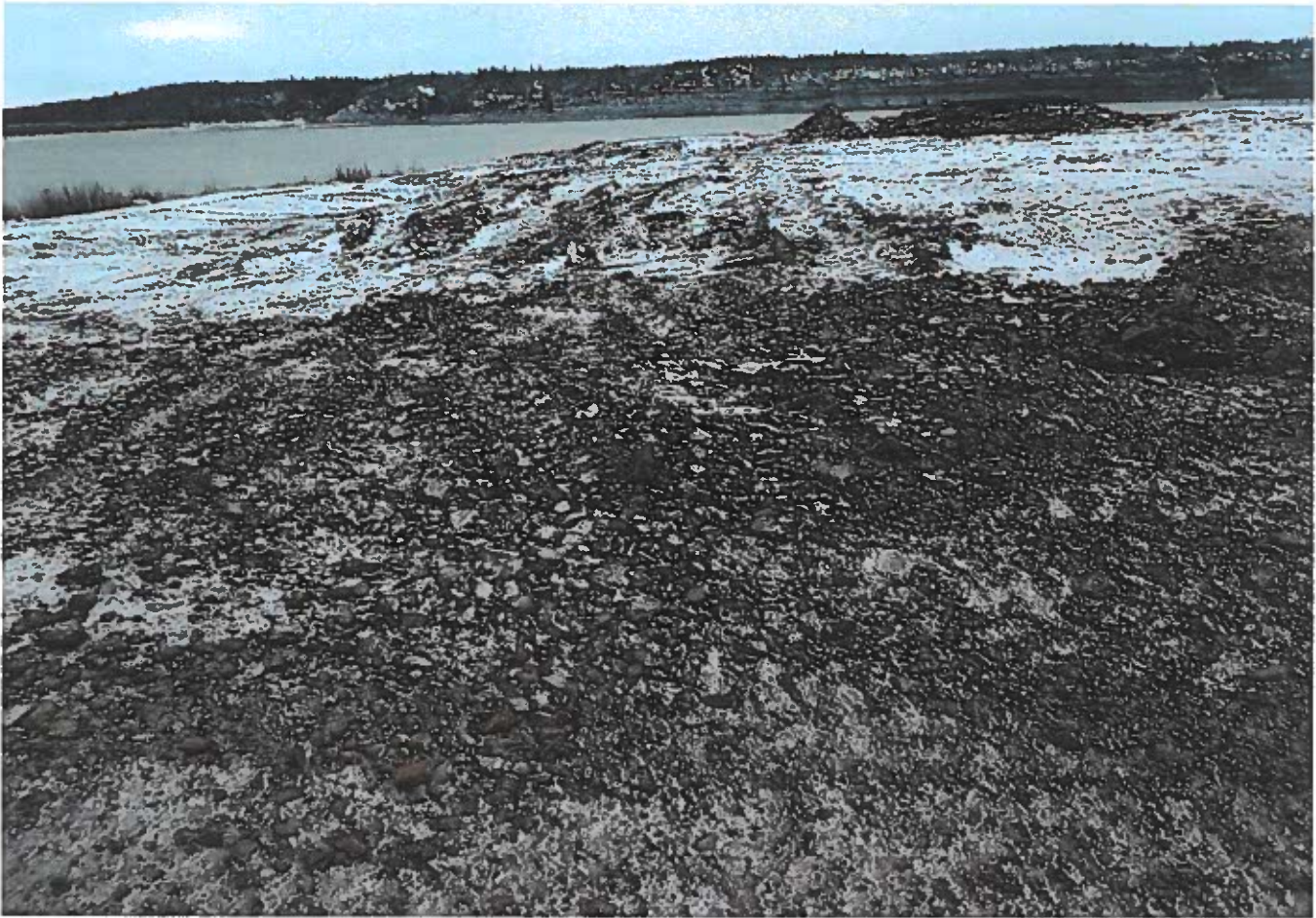
Figure 7 Mackenzie north side