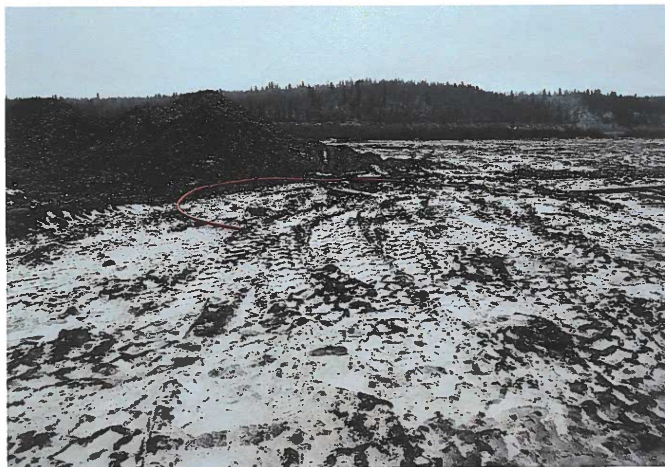
Mackenzie south side 2