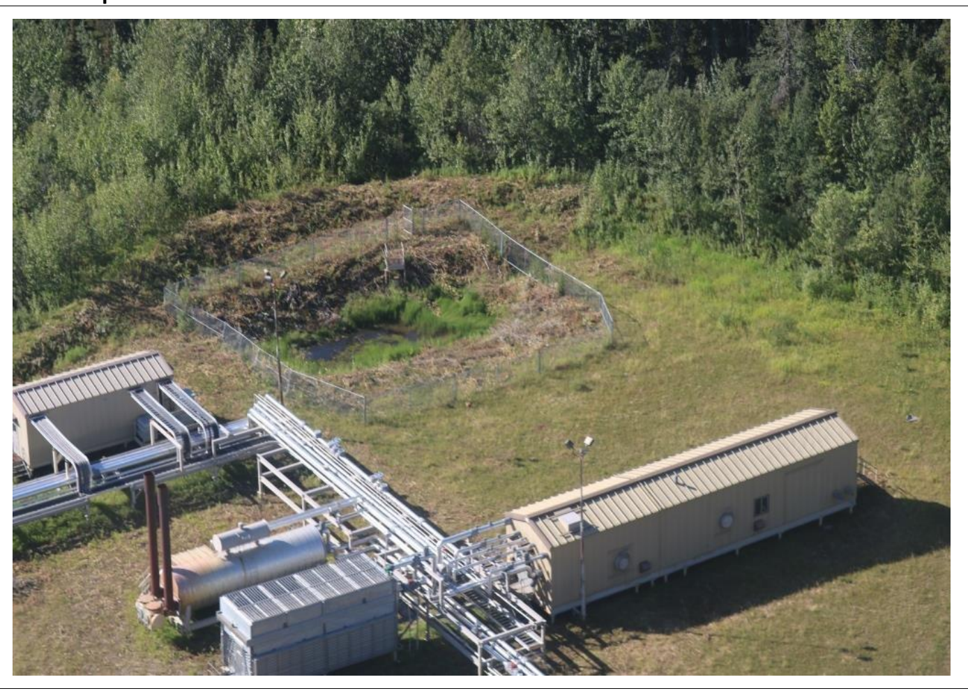
Figure 4 F-25A