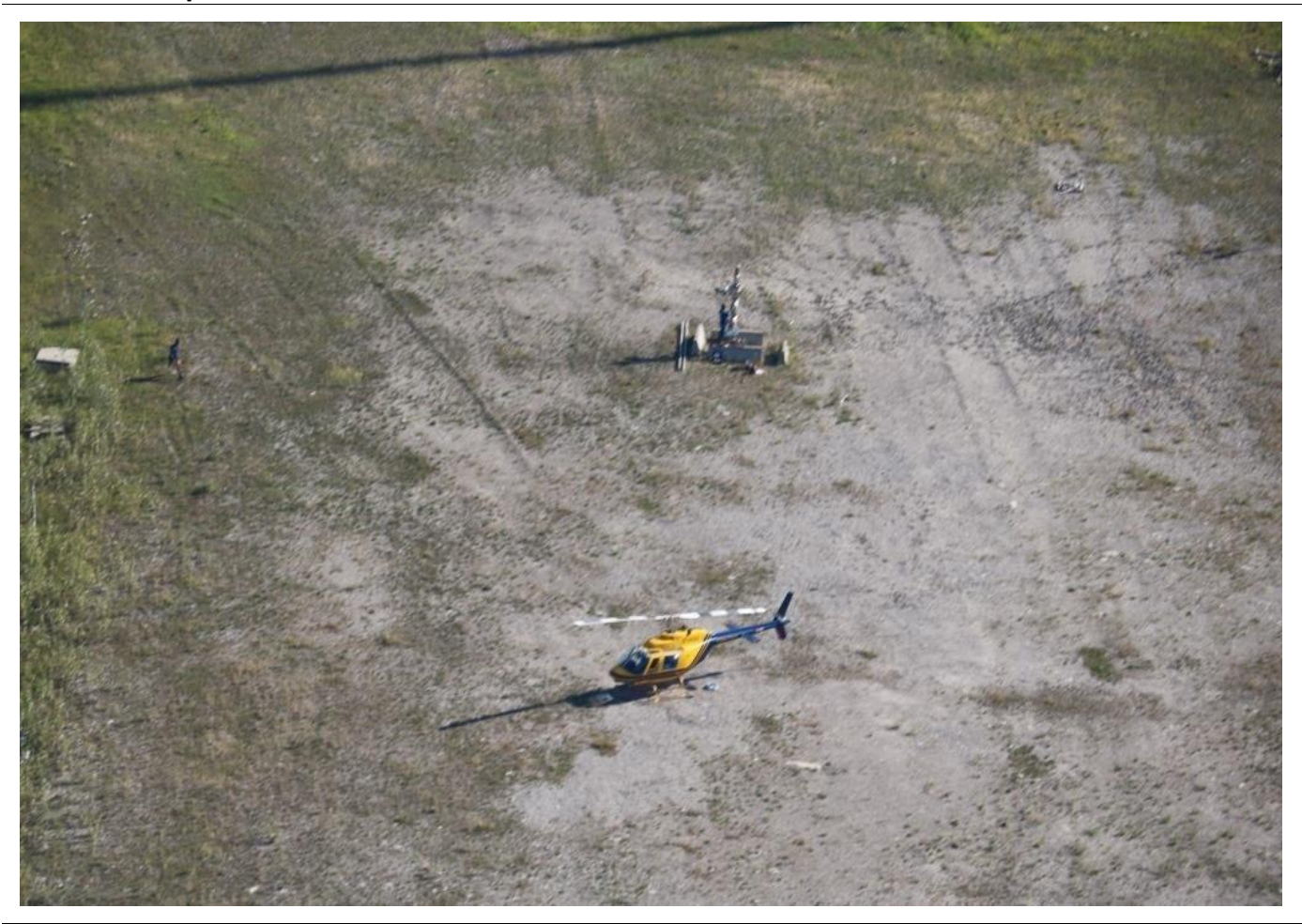
Figure 12 M-25