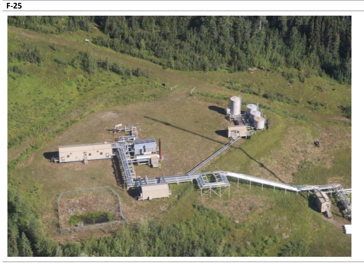
Figure 2 F-25