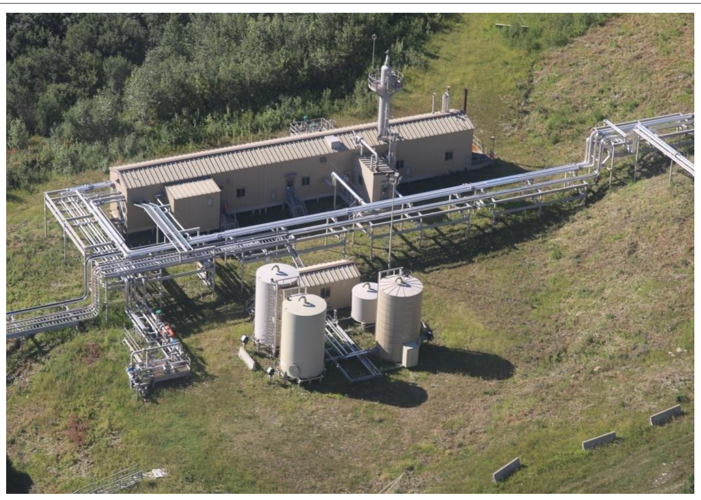
Figure 8 F-25A