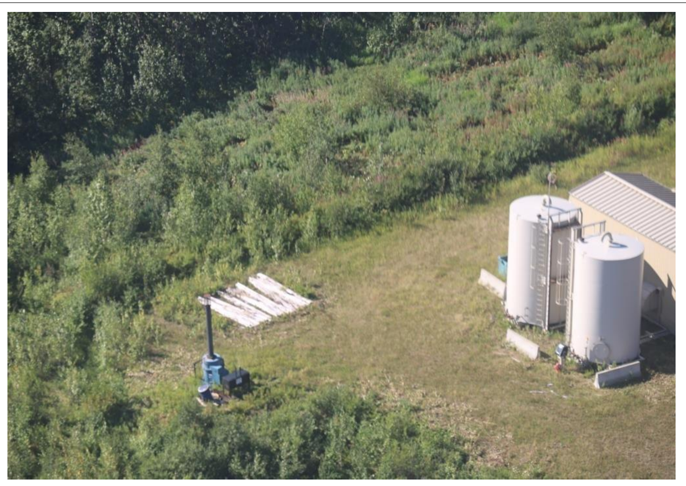
Figure 6 F-25A