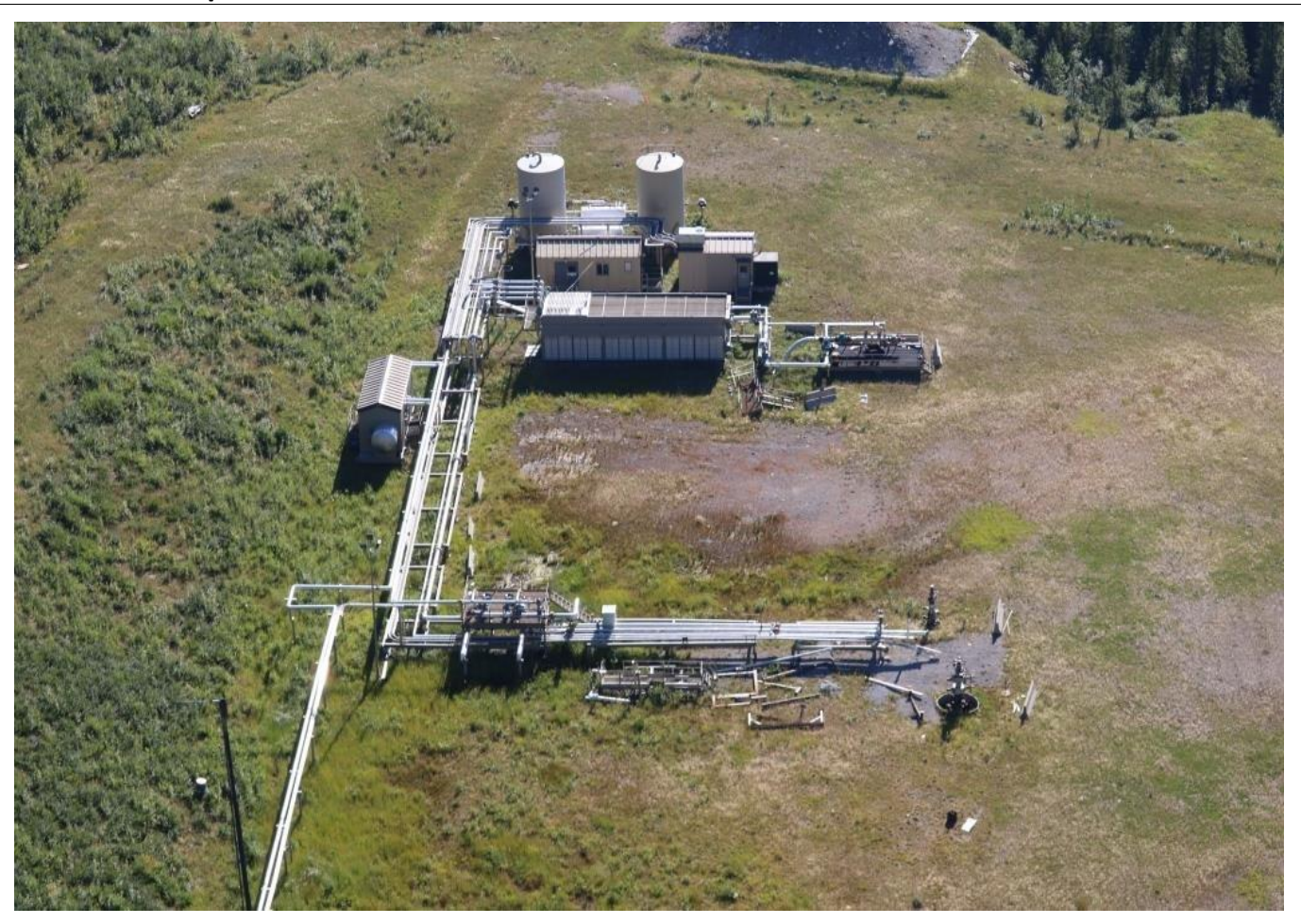
Figure 14 M-25