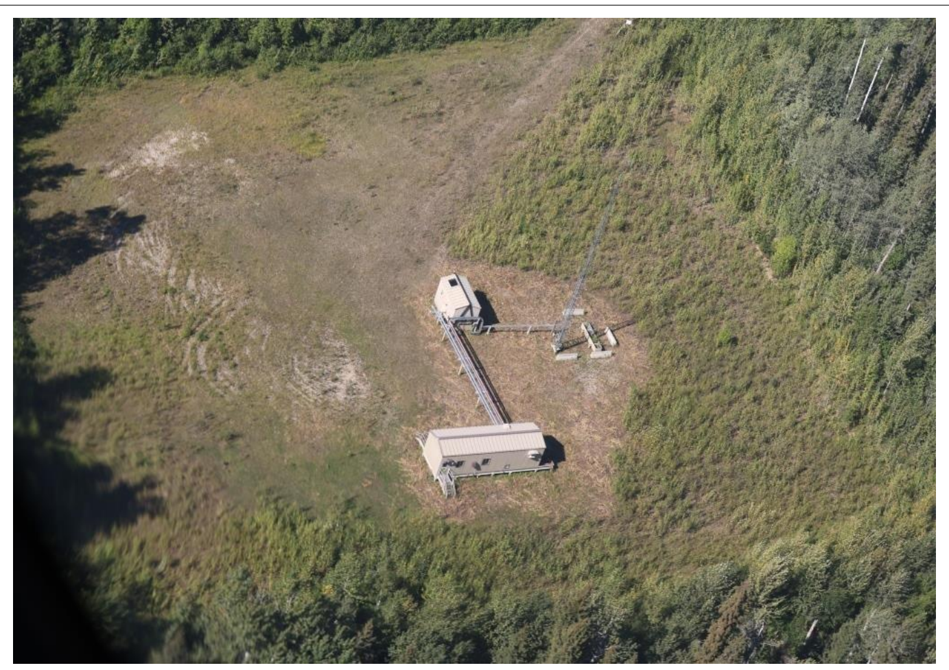
Figure 16 O-80