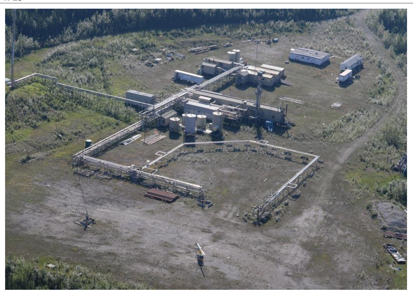
Figure 10 K-29