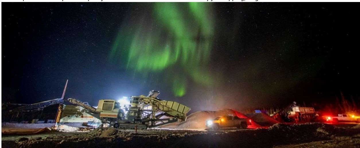
Aurora over crushers, September 2021