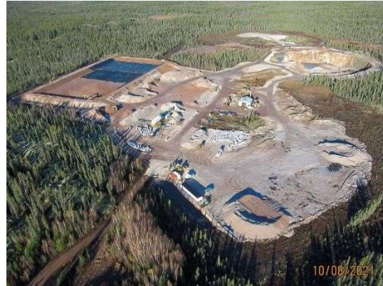
Aerial view of Nechalacho, October 2021