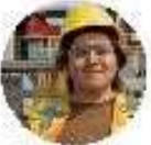
Cruze Jerome Sensor-based Ore Sorter Gwich'in Yellowknife, NT