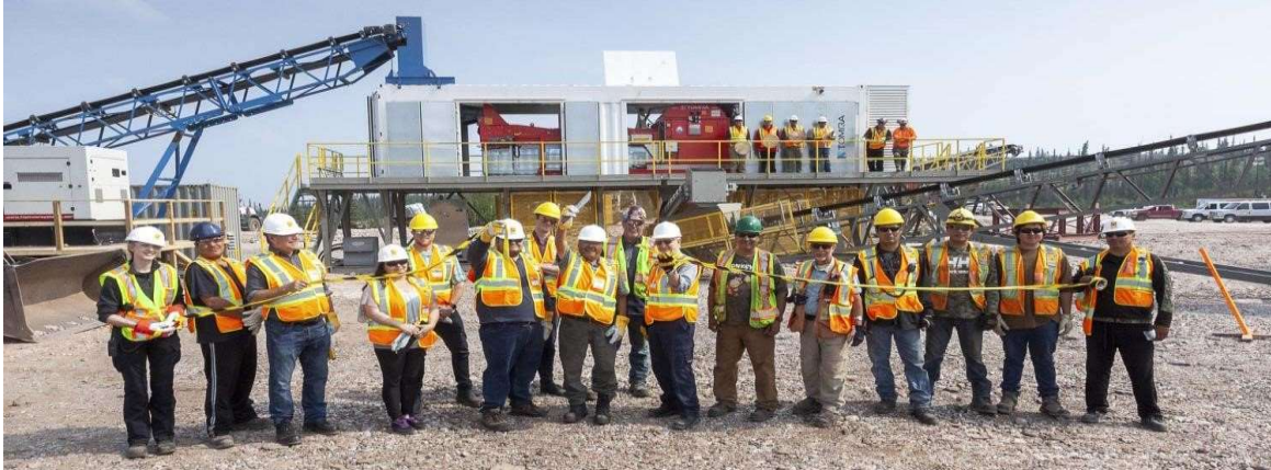
YKDFN members commission the new sensor-based ore sorter July 21, 2021. It greatly reduces mining's environmental impact.