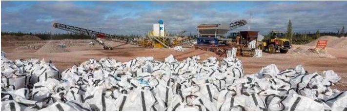
Concentrated ore with sensor-based sorter