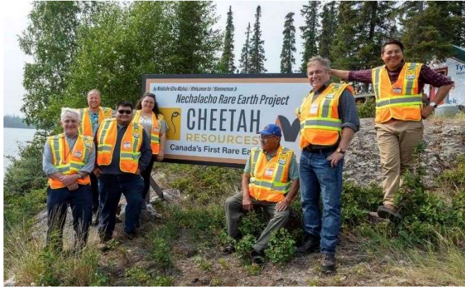
YKDFN councillors and Cheetah staff at camp, July 2021