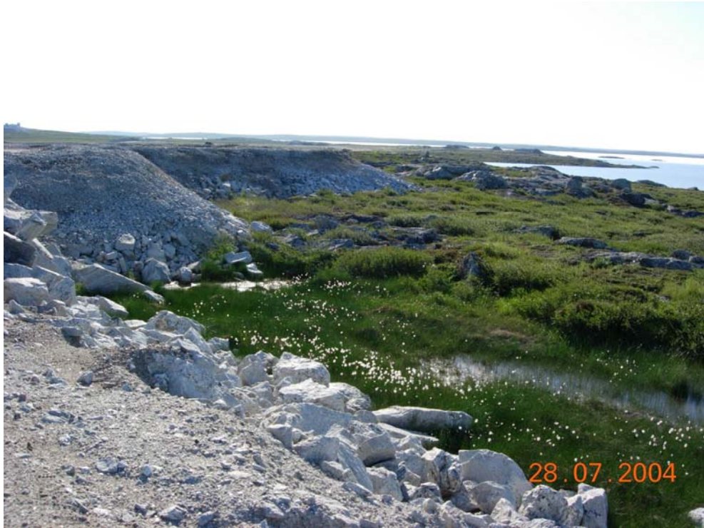
Photo 3. Wet tundra community to south of revegetation research site, Diavik Diamond Mine.