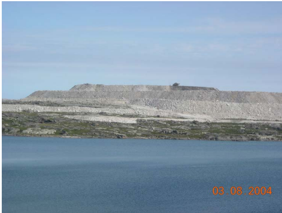
Photo 1. Overview of revegetation research site (in foreground), Diavik Diamond Mine.