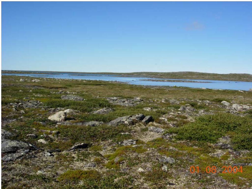
Photo 4. Heath tundra community similar to that adjacent to revegetation research site, Diavik Diamond Mine.