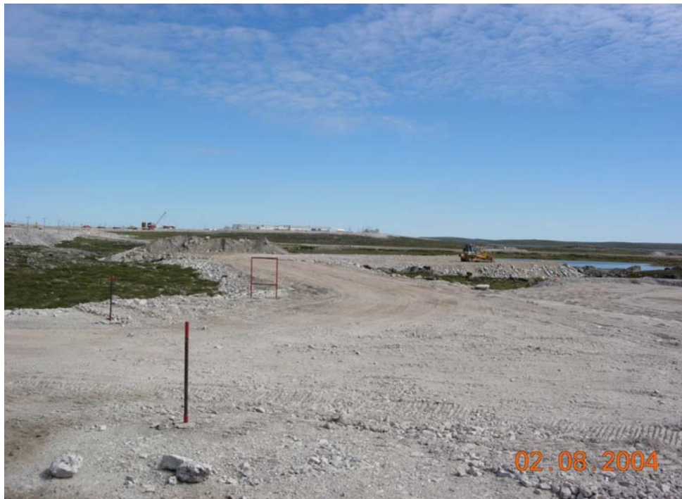
Photo 2. Revegetation research study site, Diavik Diamond Mine.