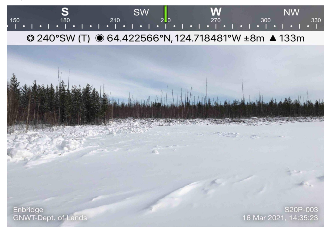
Figure 2 Camp removed, and location left clean