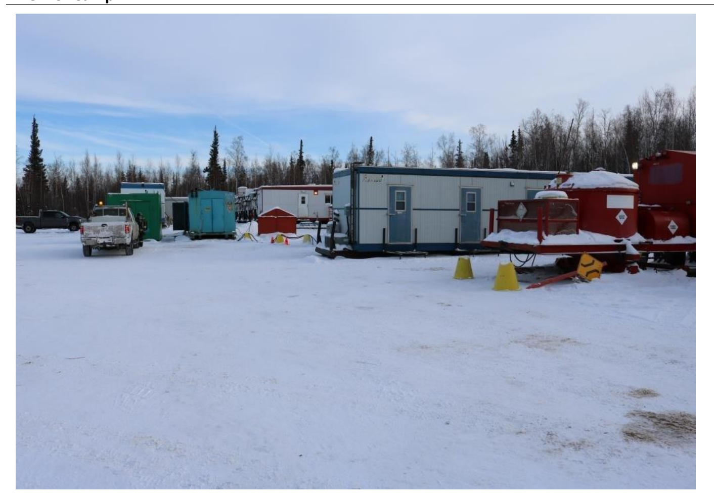
Figure 12 Camp setup