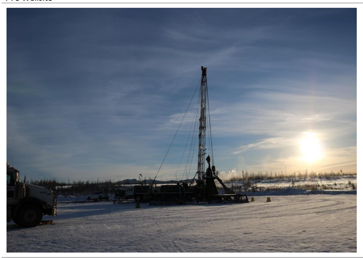
Figure 2 Propane- Wellsite