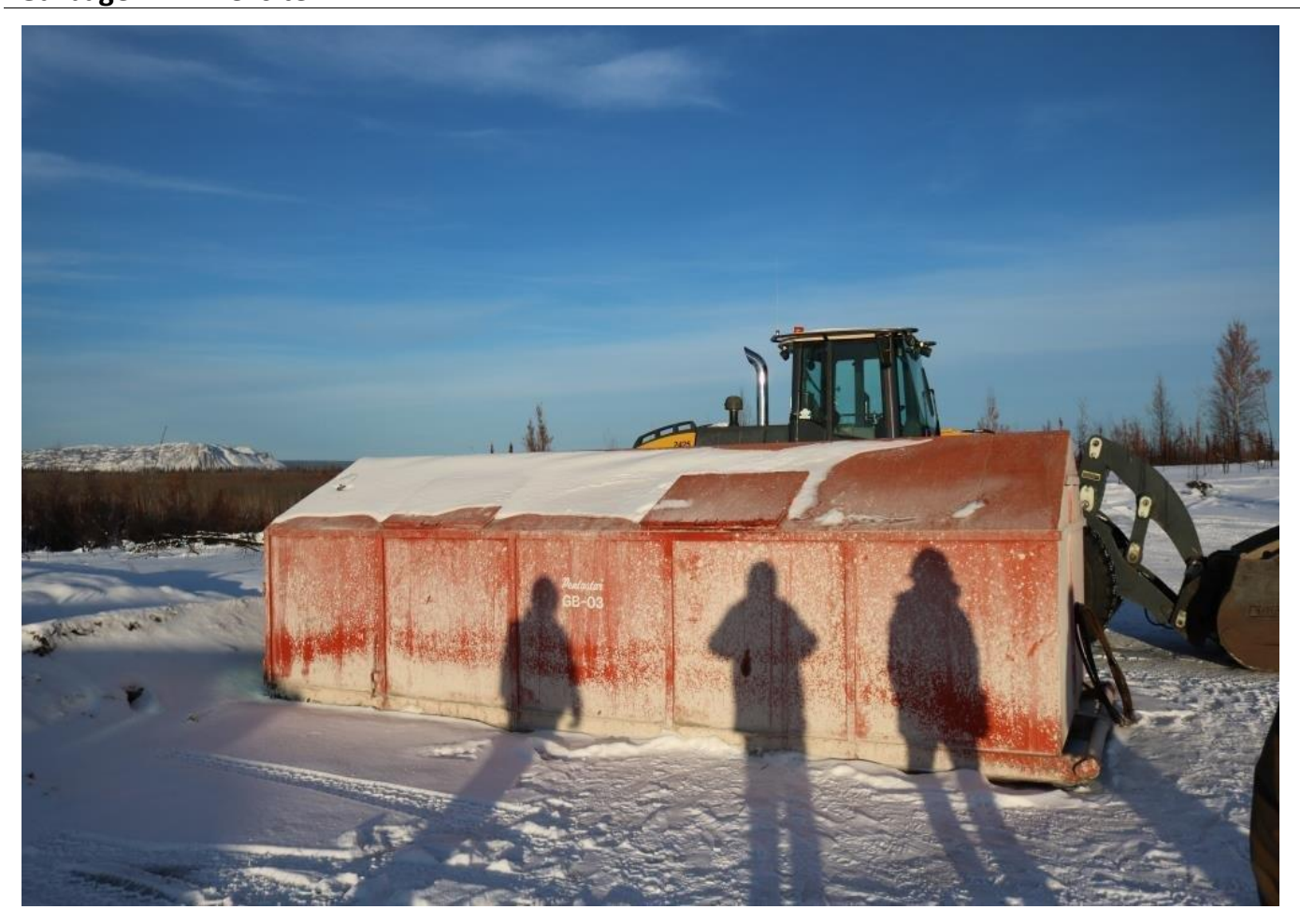
Figure 6 Loader- Wellsite