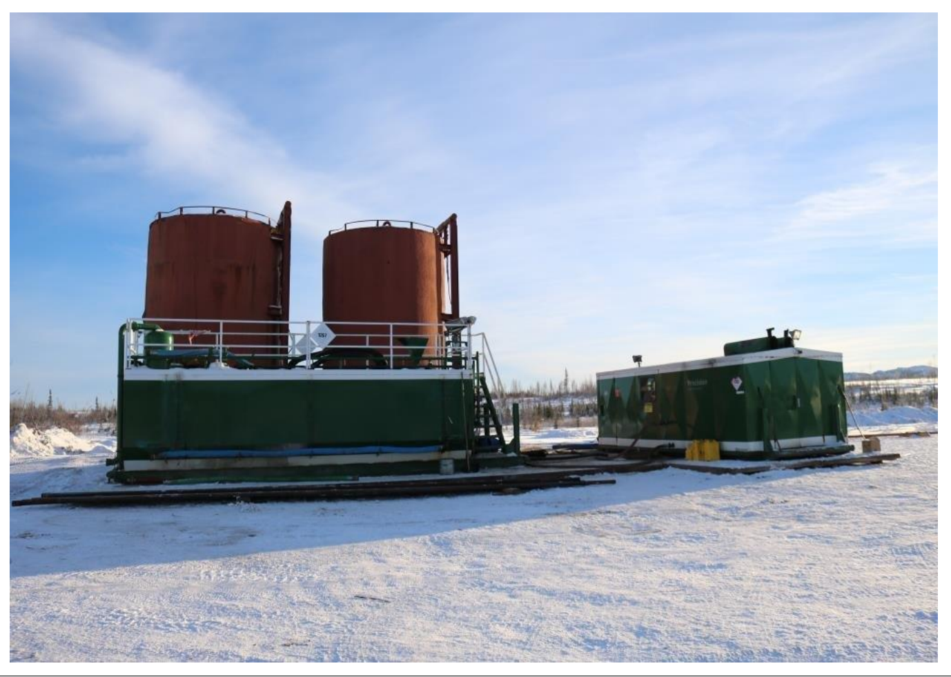
Figure 8 Spill Kit at Fuel Tank- Wellsite