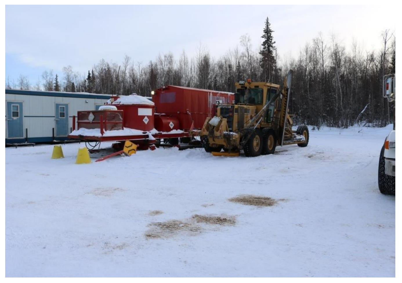
Figure 10 Workers cleaning up hydrocarbon staining- Camp