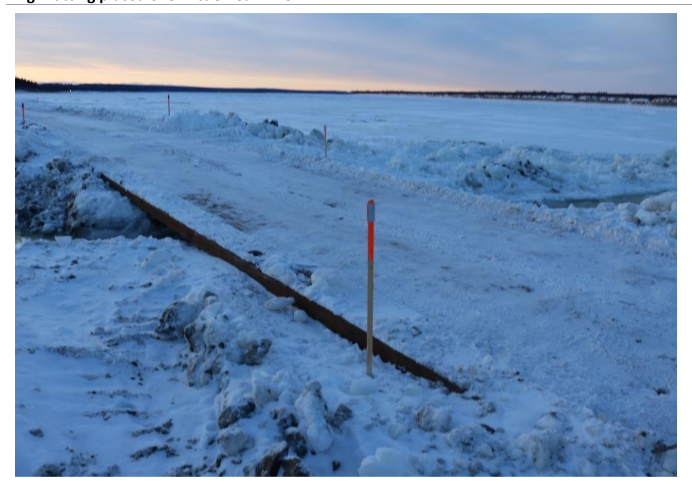
Figure 22 View of start of access road