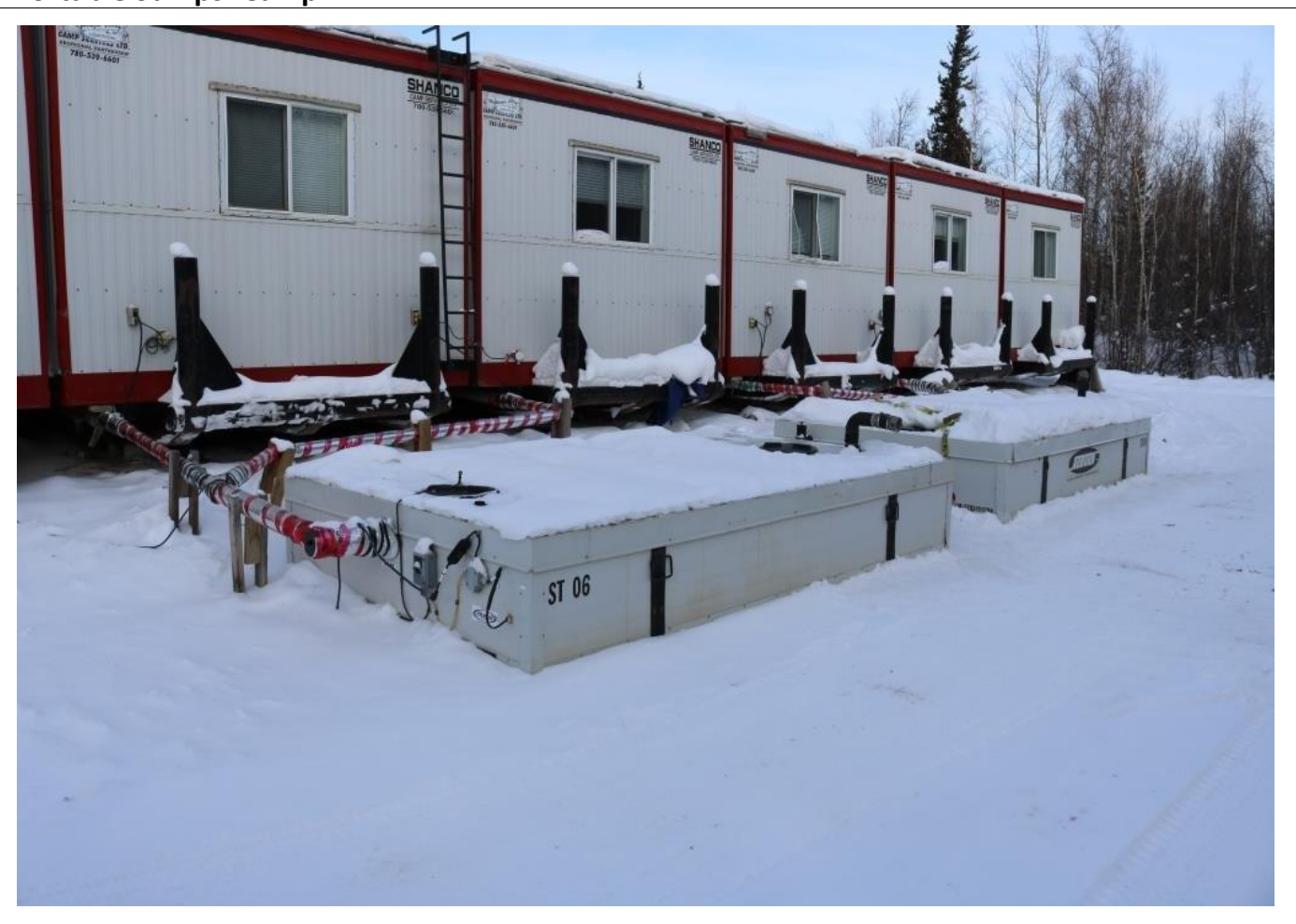
Figure 14 Fuel tank with drip trays, no spill kit- Camp