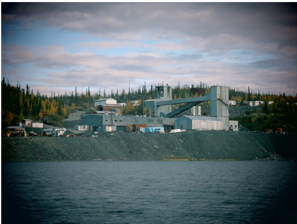
Terra Mine Site, 2015

Contaminants and Remediation Division (CARD) Crown-Indigenous Relations and Northern Affairs Canada (CIRNAC)