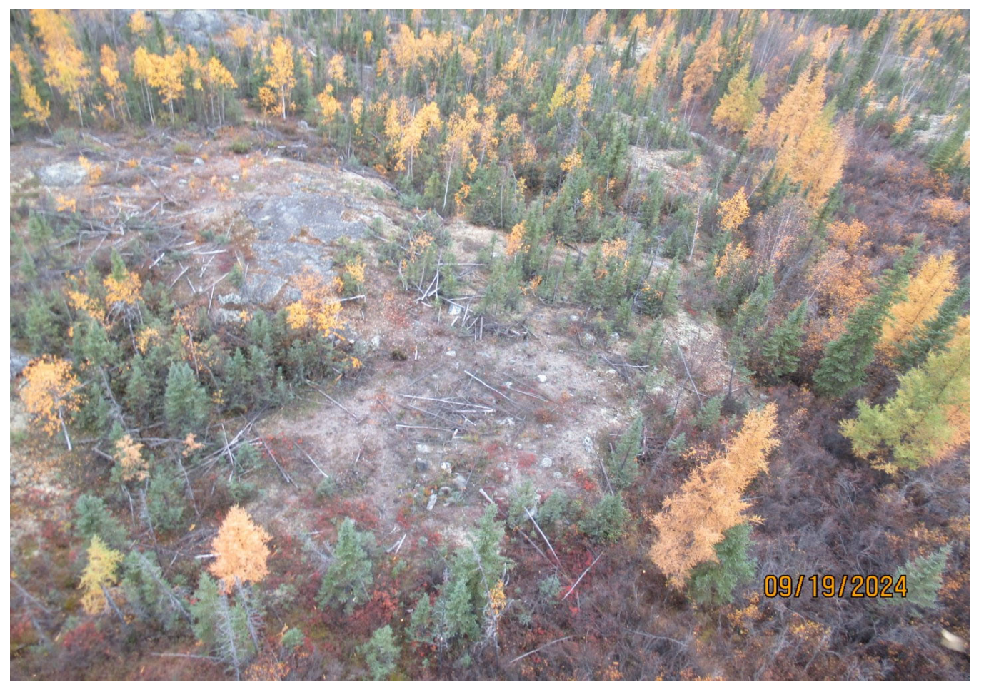
Figure 6 Another example of a completed drill site.