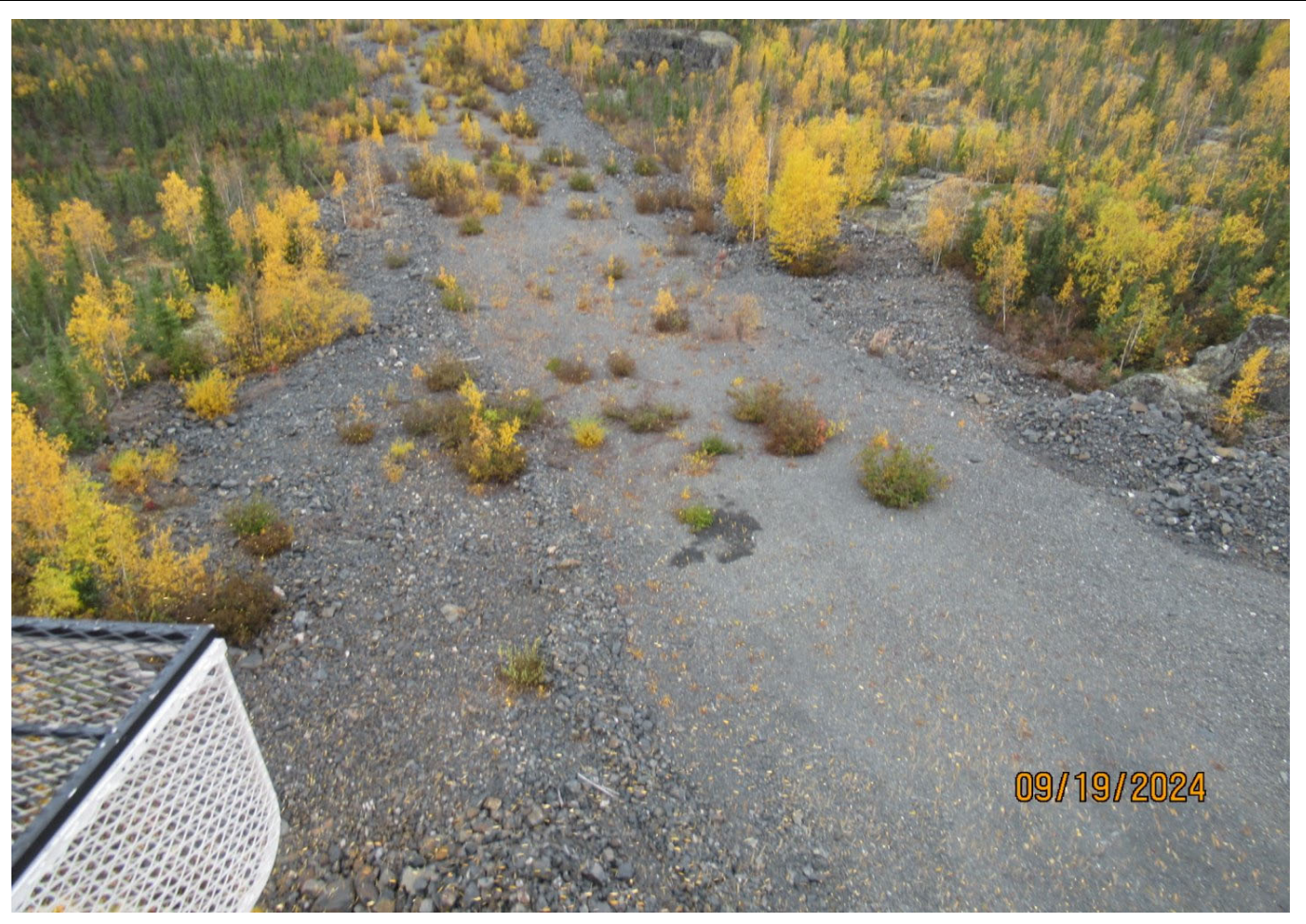
Figure 8 Completed drill site CM-P37 with a minor amount of cleanup required.