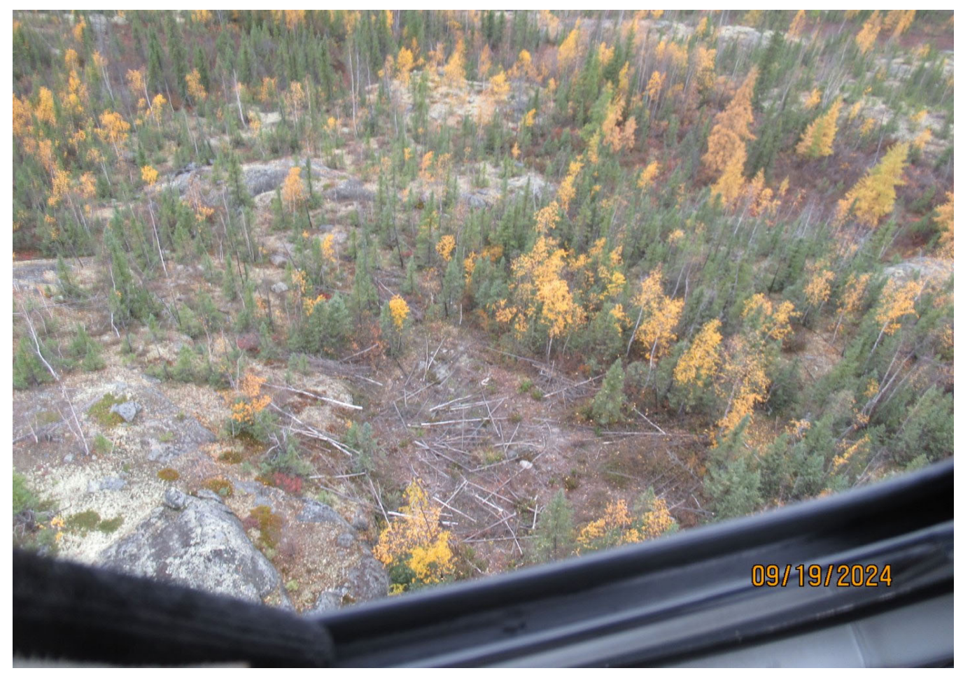
Figure 4 Another example of a completed drill site from the Summer of 2023.