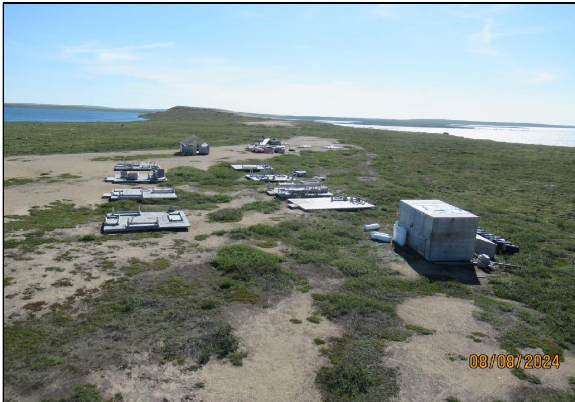
Figure 3: Ground view of camp location in shutdown 08August2024 looking southeast.