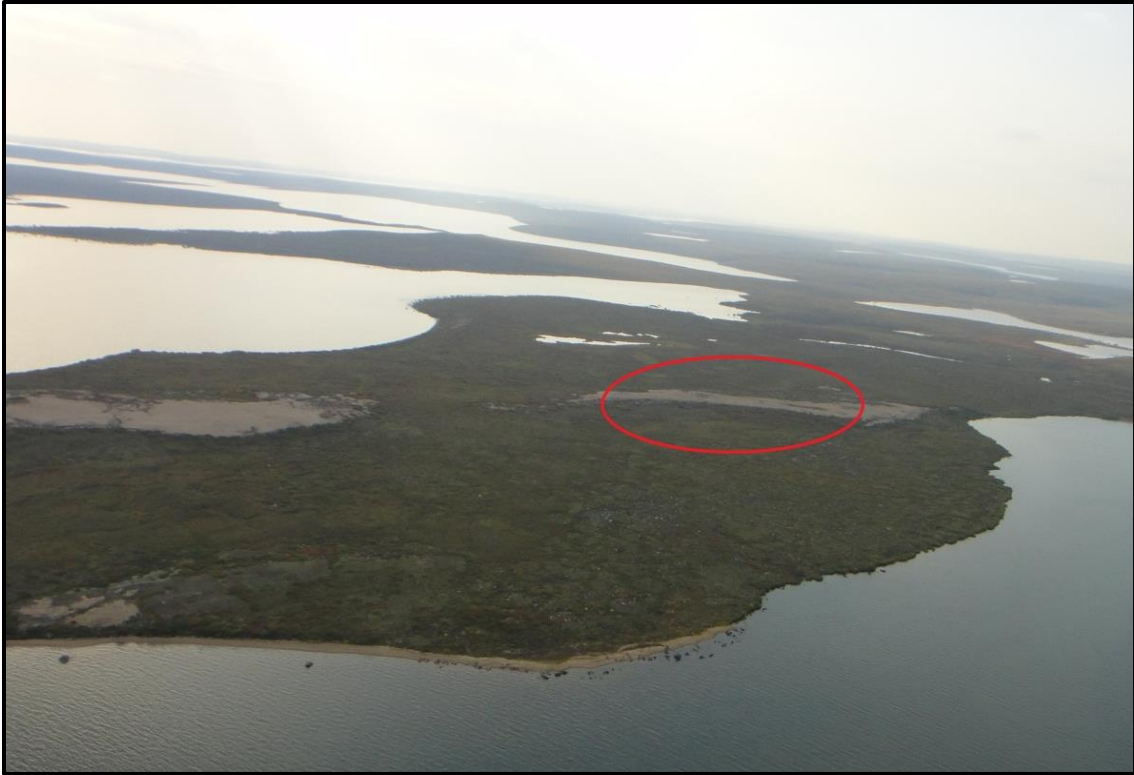
Figure 2: Ariel view of the camp location looking southwest